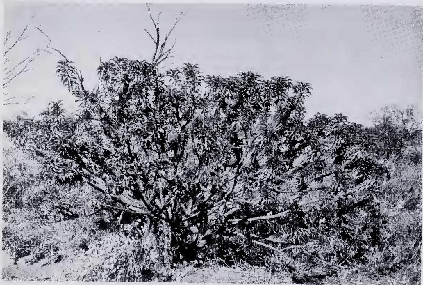
Figure 1.—Habit of E. ramiflora . Bush about 1.5 m high.

Compact shrub , 1-3 m high, vegetative parts glandular hairy, resinous; branchlets thick, rigid, with amber-coloured resin droplets, with remnants of deflexed leaf bases ca. 0.5 cm long. Leaves lanceolate, alternate, crowded, spreading, deflexed when mature, 1.2-2.2 cm broad, up to 7.5 cm long, slightly keeled and recurved; blades viscid, green, gradually attenuate or cuneate into the petioles which are difficult to distinguish from the lamina; petioles almost decurrent; margins entire, undulate or repand, rarely serrulate; apex acute. Flowers axillary, usually solitary or in small groups, borne on previous season's branchlets and on leafy young branchlets; peduncles 0.7-1.2 cm long, spreading slightly turned up under the flower; calyx segments